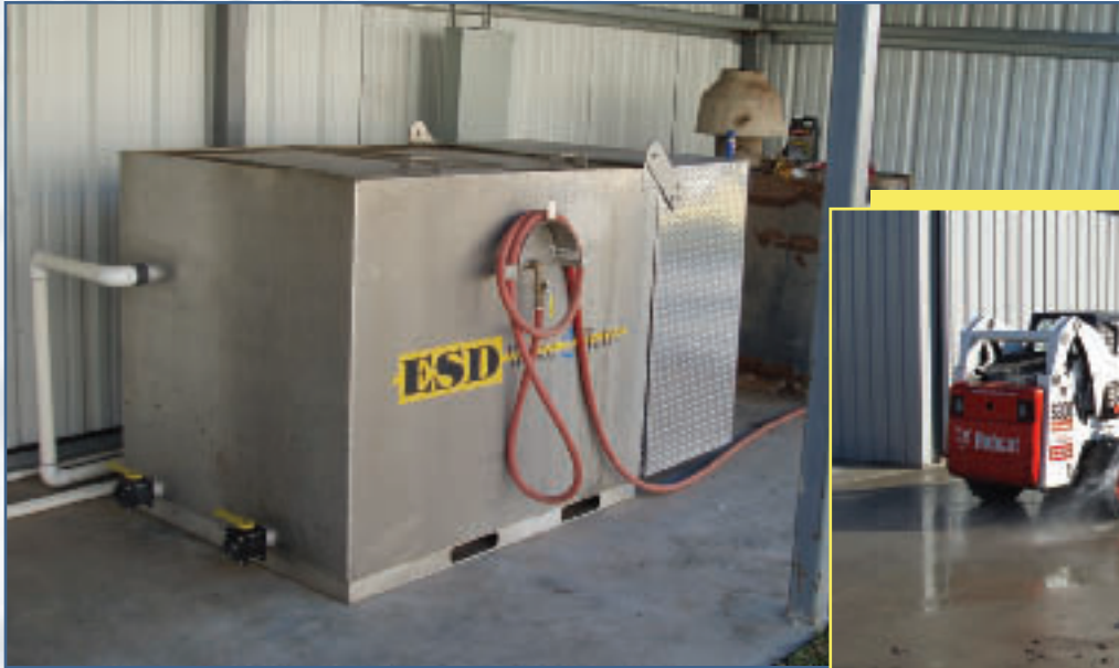
Model 750 Biological Recycle System and Pressure Washer