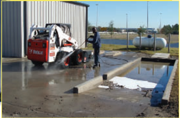
Equipment wash area with drive-in mud pit

Industrial Wash Water Recycle Systems. ESD Waste2Water offers a full line of industrial wash water recycle systems designed to supply between one and six pressure washers for washing industrial equipment or parts. For optimal performance, ESD Waste2Water, Inc. will design, at no charge, a wash area for your particular application. The models 750, 850 & 5000 are versatile, require low maintenance and are extremely effective for such wash applications as: